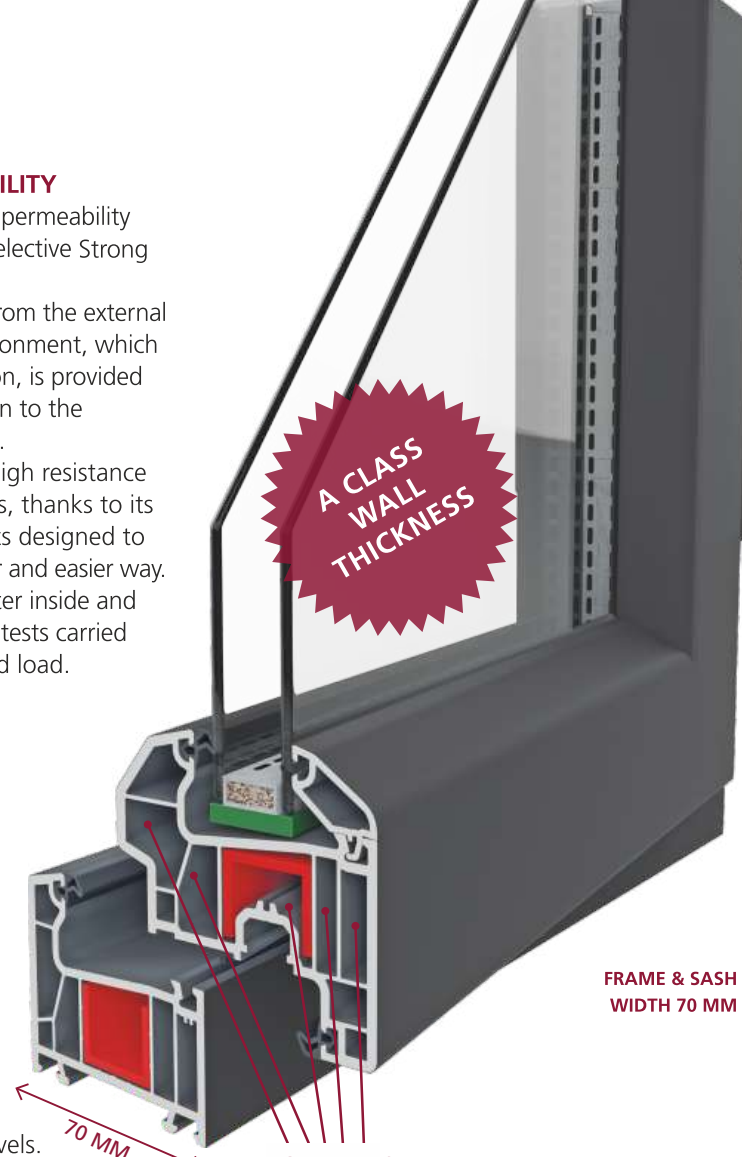
FRAME & SASH WIDTH 70 MM